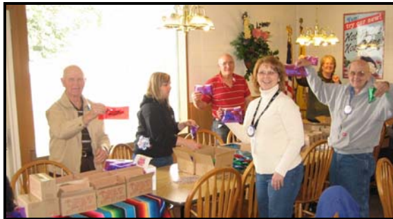
Myrtle Point Rotary members volunteered to work as an assembly team for Ready to Smile. They assembled 452 dental kits in 45 minutes comprising a toothbrush, floss, toothbrush cover, disclosing tablets, toothpaste and a two-minute timer, all packed neatly in a zippered vinyl pouch.

Contact Ready to Smile Coordinator Cecilee Shull to discuss your role.