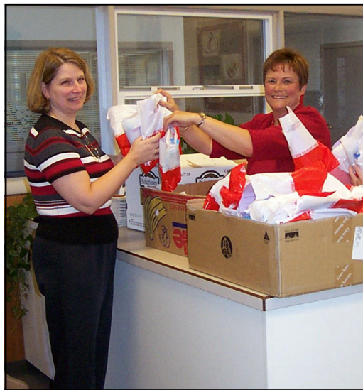
Coos Bay Soroptimists package dental kits for the Ready to Smile Program